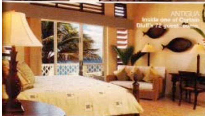
ANTIGUA Inside one of Curtain Bluff's 72 guest rooms.

Curtain Bluff resort traditions include toasting your future at the hotel's daily cocktail hour and slow-dancing under a tamarind shade tree.