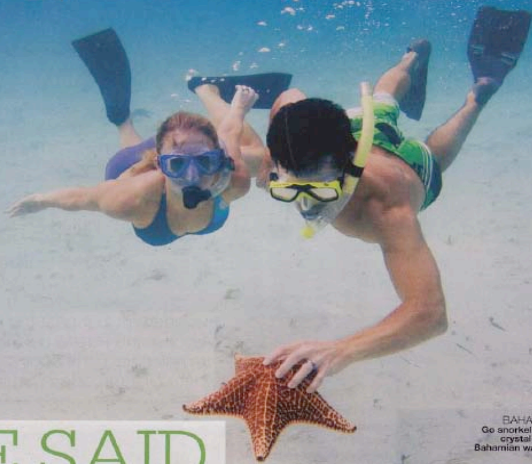
BAHAMAS Go snorkeling in crystal clear Bahamian waters.