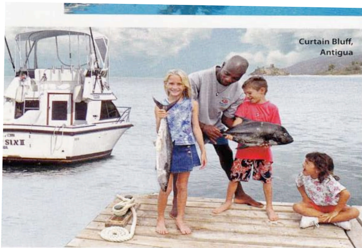
Curtain Bluff, Antigua

Something for everyone—is that too much to ask in a family vacation? We don't think so! If the kids want to surf, the grandparents head to the pool, mom books a spa treatment, and dad plays golf, these days it's easier than ever to please everybody. Top resorts on every coast are catering more to multigenerational families who are vacationing together. Group activity lists are growing, and so are the rooms, the dining options, and the deals. We found 10 destinations that make family travel a breeze. Spread the word: This year's reunion is on the beach!